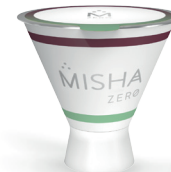
GRAPE MINT ZERO